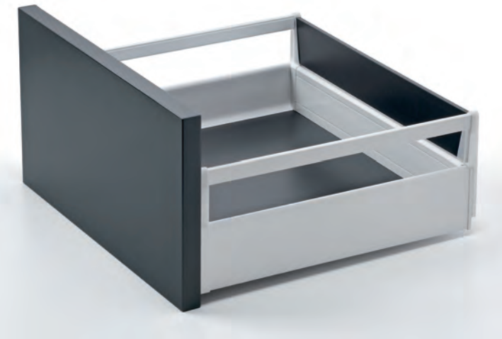
TUBICINI LONGITUDINALI LONGITUDINAL TUBES